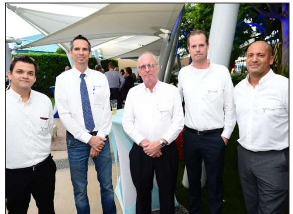
The project team of Gamma responsible for the successful implementation of the Online ED card

Locally based software developer and proud CTO member Gamma IT Solutions developed the Aruba Online ED Card ( https://edcardaruba.aw/ ) that travelers are now directed to upon purchasing their plane tickets to Aruba. Known for its expertise in developing customized software, Gamma used the latest tools in software engineering to create the online card.